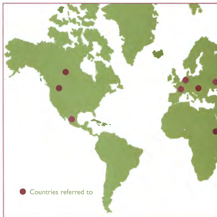
● Countries referred to

If you would like to support the campaign, please write to the following people, and urge them to do all they can to fight the court decision.